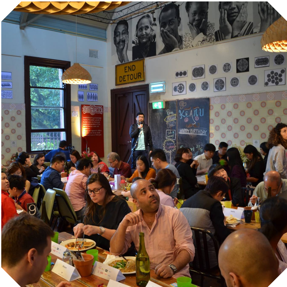
Photos were taken at the Fundraising dinner on 28th October 2018