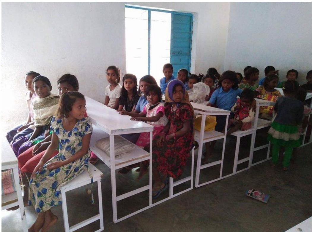
Sitting with good posture ensure the body is in good alignment and reduce strain, tight or achy muscles in the neck, back, arms and legs. (photos showing the desks and chairs built by Hundred School Project Inc.)