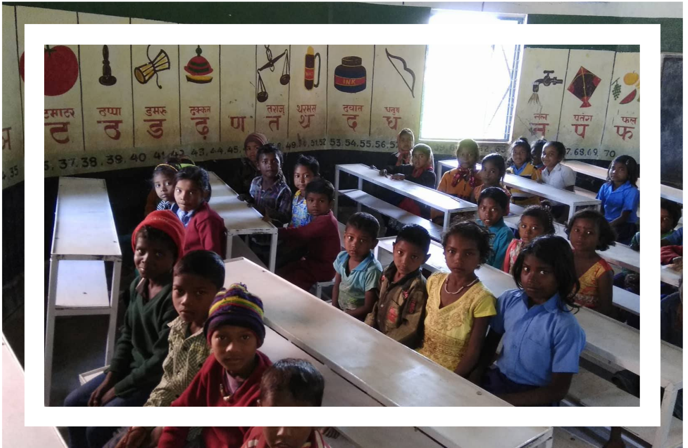
School children at Barki Babhani primary school can now sit with good posture during the school time