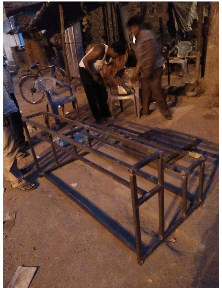
Photos showing the construction of study desks by the local carpenters hired by Hundred School Project at Bodhgaya, India