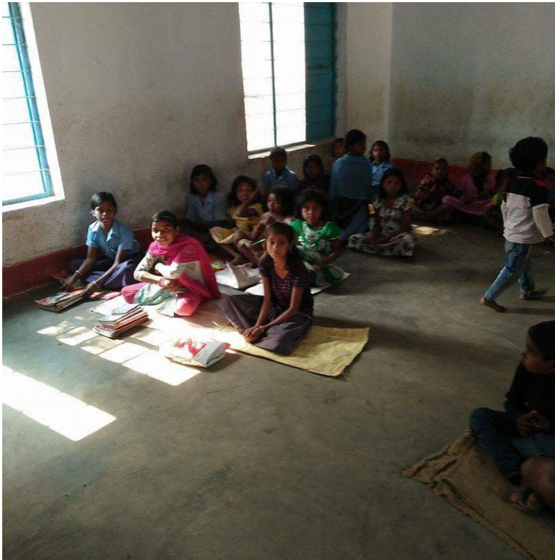
School children sit on the floor for long hours during school in winter and summer (before our donation)